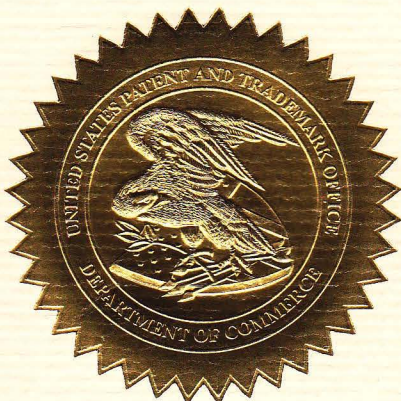
Director of the United States Patent and Trademark Office

To avoid CANCELLATION of the registration, the owner of the registration must submit a declaration of continued use or excusable non-use between the fifth and sixth years after the registration date. (See next page for more information.) Assuming such a declaration is properly filed, the registration will remain in force for ten (10) years, unless terminated by an order of the Commissioner for Trademarks or a federal court. (See next page for information on maintenance requirements for successive ten-year periods.)